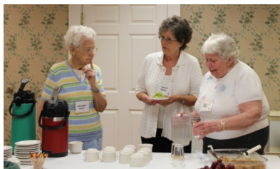
Women from Circle 6 enjoying coffee and snacks